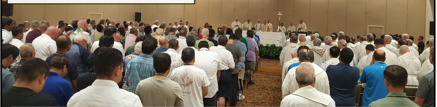
Nearly 400 priests and bishops of Los Angeles gathered for Eucharist at our 2019 Convocation. Thank you for your prayers.

5550 Thornburn Street Los Angeles, CA 90045 www.stjeromelax.org 310-348-8212