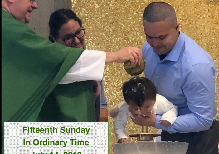
Fifteenth Sunday In Ordinary Time July 14, 2019