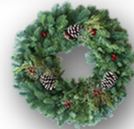
24" ROUND WREATH