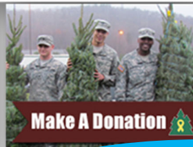
Make A Donation