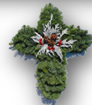
24" CROSS WREATH