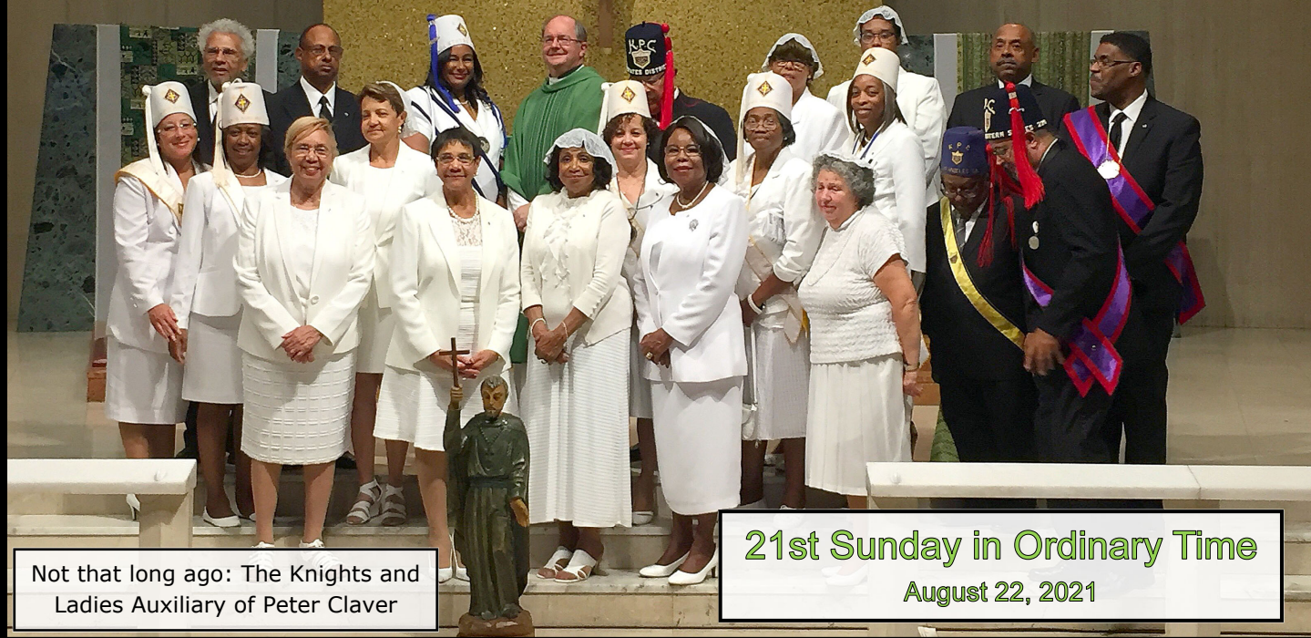
Not that long ago: The Knights and Ladies Auxiliary of Peter Claver

21st Sunday in Ordinary Time August 22, 2021