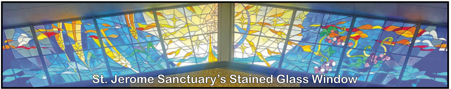
St. Jerome Sanctuary's Stained Glass Window

Just left of center the hand of God reaches down to touch creation. Please note that the part of the hand that is visible is a shade of pink which can be seen in the palms of all people's hands.