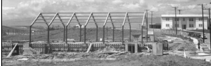
Our Church Property looked different in the fall of 1949 (No 405 Freeway) as we see the frame of the first church, now our parish hall.

22nd Sunday In Ordinary Time September 1, 2024