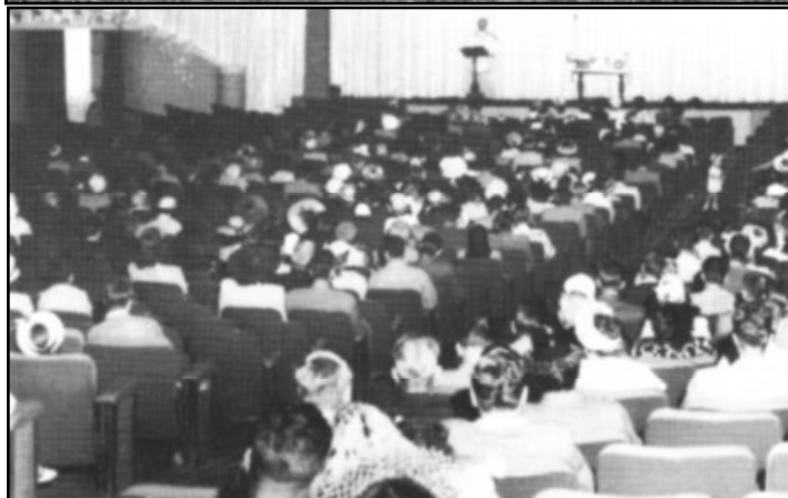
First Mass Held at La Tijera Theater — 1949